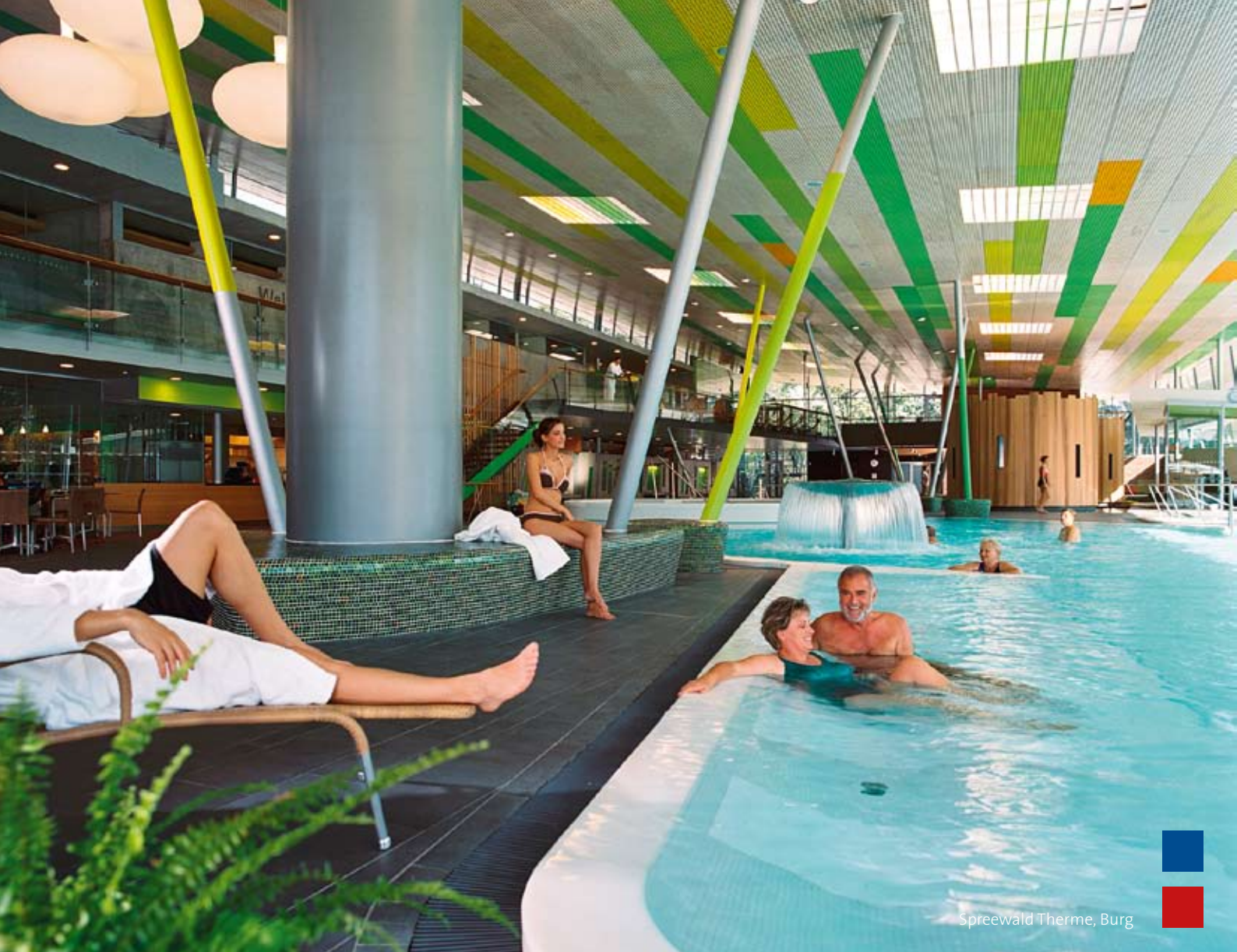
Spreewald Terme, Burg